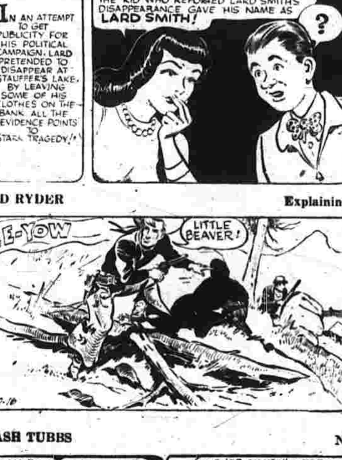
"I'm sorry I said some of the things I did, but..."