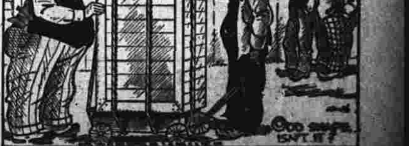
"I'm sorry I said some of the things I did, but..."