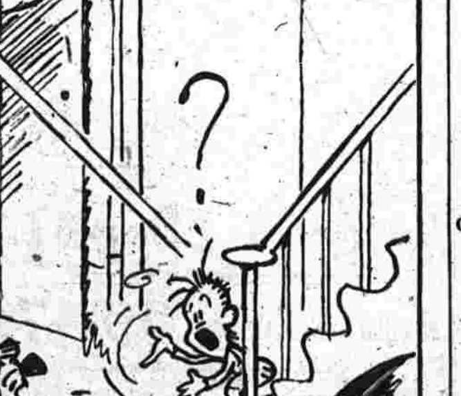
"Waitaminit! Waitaminit! How do you know Hitler ain't bin around here!"