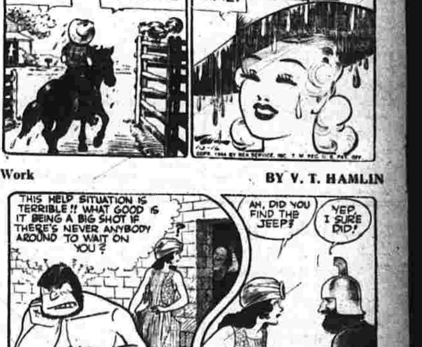
"I'm sorry I said some of the things I did, but..."