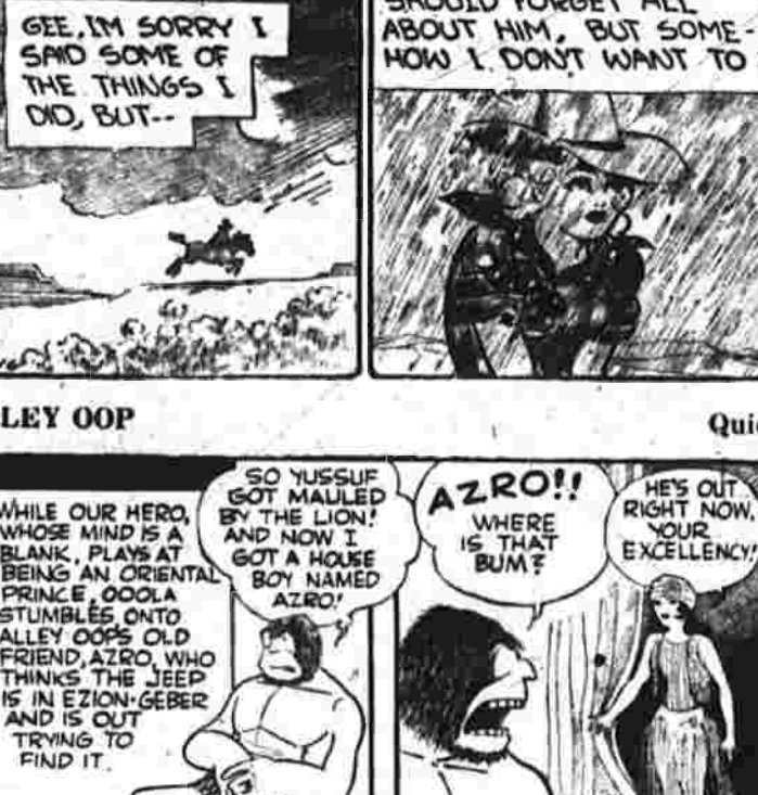
"I'm sorry I said some of the things I did, but..."