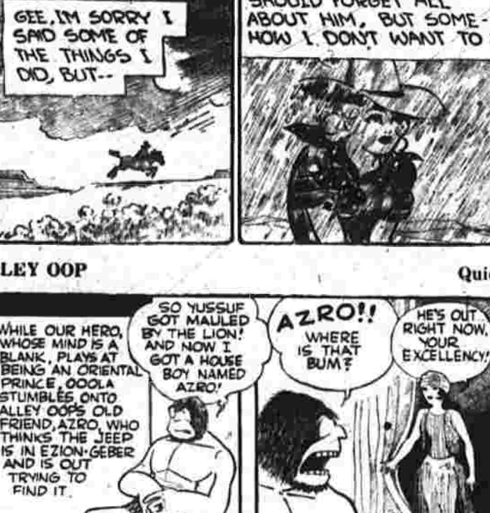
"I should have said something about my suit some time ago, but..."