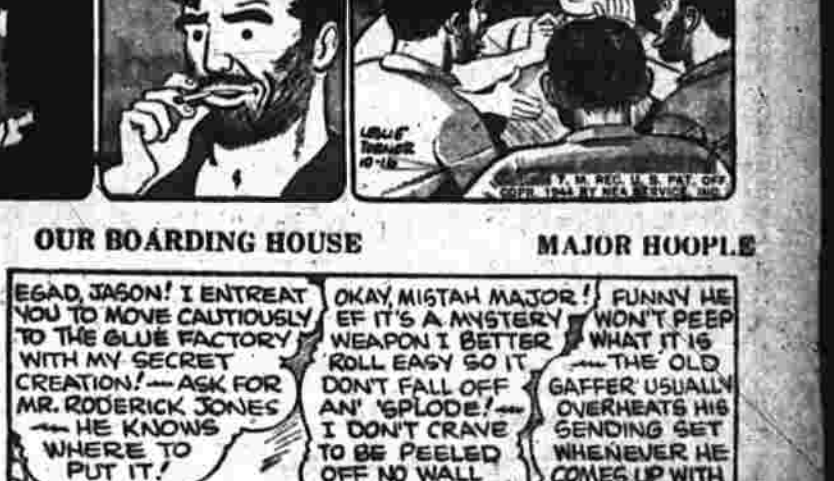
"I'm sorry I said some of the things I did, but..."