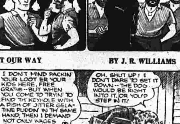
"I'm sorry I said some of the things I did, but..."