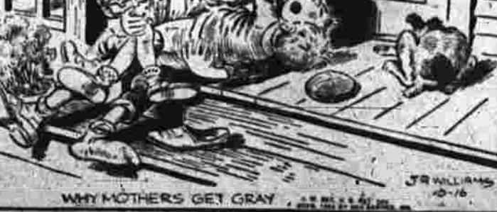
"I'm sorry I said some of the things I did, but..."