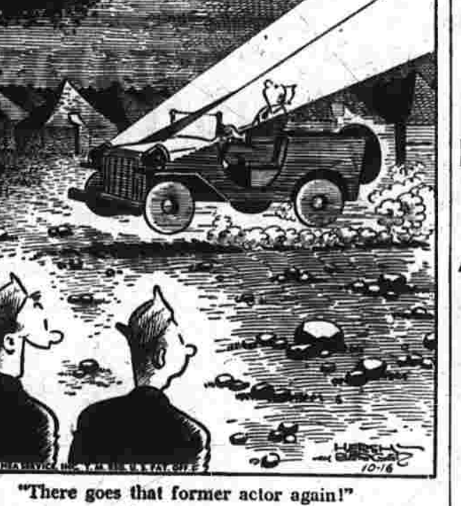
"There goes that former actor again!"